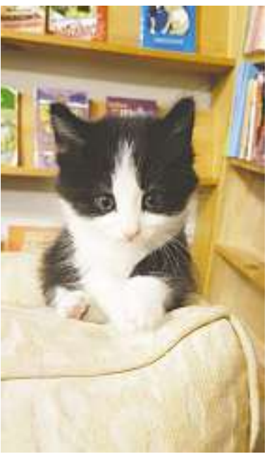
The kittens at Otis & Clementine's are quick to find homes.