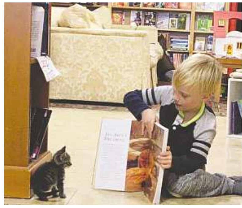
A young reader shares a tale with a curious companion.