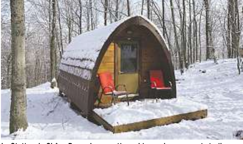
La Station du Chêne Rouge has creative cabins and snow-sports trails for cross-country skiing, snowshoeing and winter hiking, in the woods outside North Hatley. LA STATION DU CHÊNE ROUGE

Luxury in glamping is measured differently than luxury