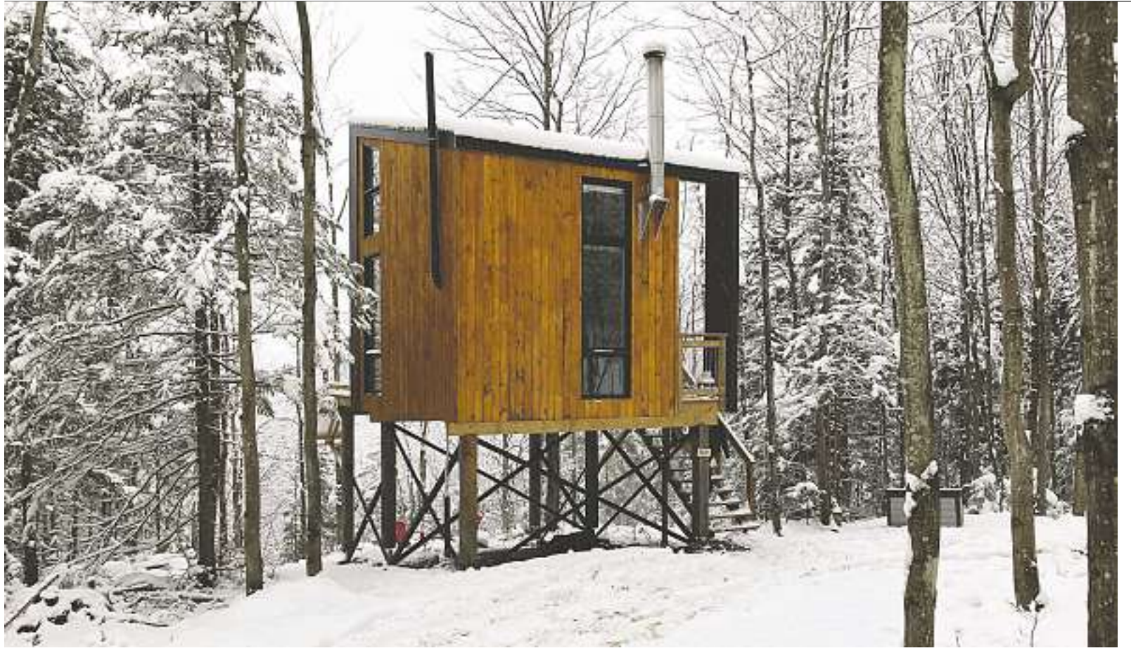
The dwellings of Laö Cabines de Racine are perched high on a hill for dramatic views of Eastern Townships mountains and valleys. "It's like living outside, but you are indoors," says owner Marie Courtemanche.

B20 SATURDAY, MARCH 21, 2020 MONTREAL GAZETTE